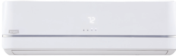
619P*B High Wall

THE 38MA*R OUTDOOR UNIT SINGLE ZONE IS COMPATIBLE WITH VARIOUS STYLES OF INDOOR UNITS, WHICH CAN BE SELECTED BASED ON THE APPLICATION.