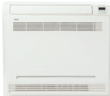
619R*F Floor Console

For indoor unit performance information, please reference the Bryant Ductless Full Line Catalog.